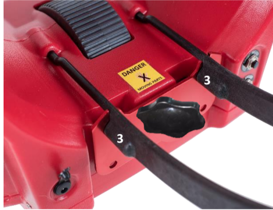
BOTTOM OF MACHINE 设备底部