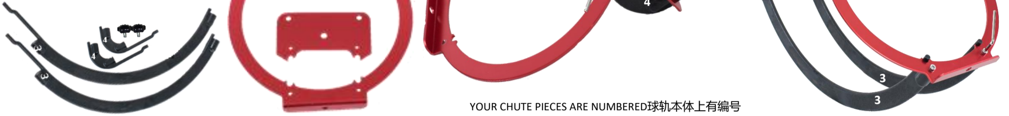
YOUR CHUTE PIECES ARE NUMBERED球轨本体上有编号